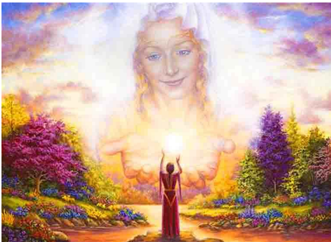
can be seen as a meeting with the over-higher-self:

Would they not rather be dreaded as an ordeal? What should be our aim? To help and encourage and hearten the dead, or to indulge our own grief and relieve our feelings at their expense? The parting and the loneliness, the loss of the breadwinner and protector, or the lifelong companion, are indeed a grief, but a grief to be bravely borne in order that our darkness may not overshadow the beloved one. We ought to accept our lot cheerfully so that they may be free to go through the great experiences of the soul and enter into their rest with a quiet mind.